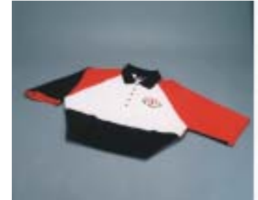
STI Team Shirt