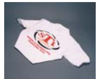
Typical STI Shirt Back